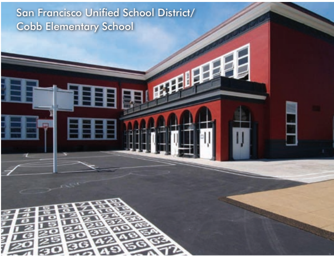
San Francisco Unified School District/ Cobb Elementary School