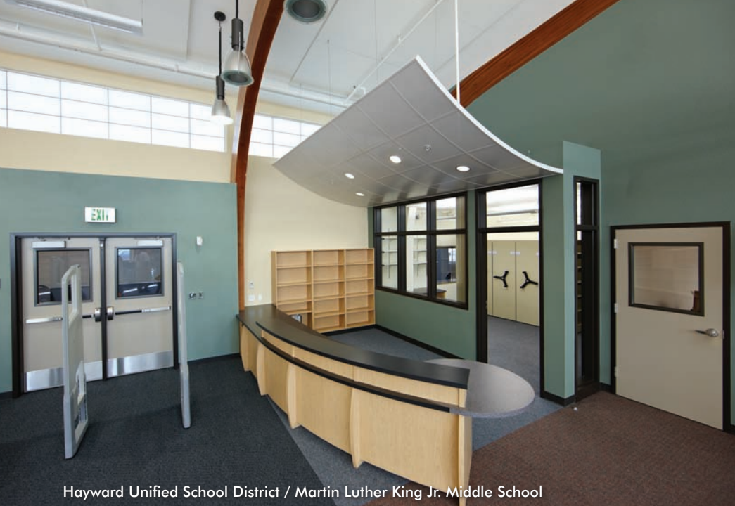
Hayward Unified School District / Martin Luther King Jr. Middle School