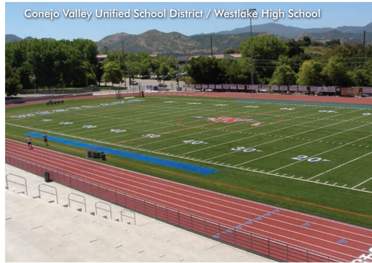
Conejo Valley Unified School District / Westlake High School