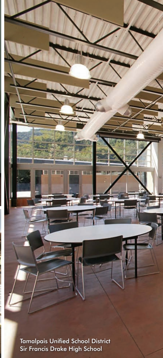
Tamalpais Unified School District Sir Francis Drake High School