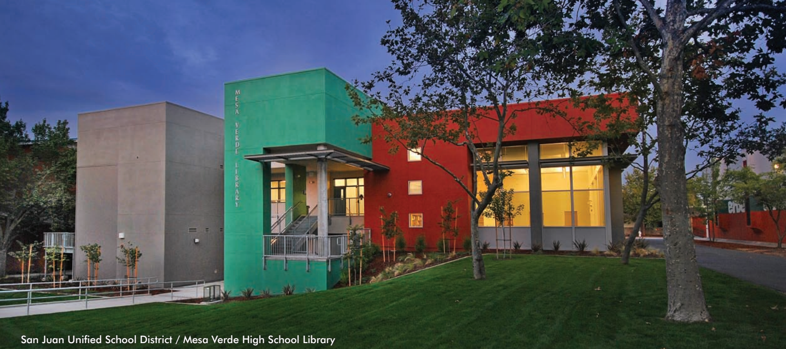
San Juan Unified School District / Mesa Verde High School Library