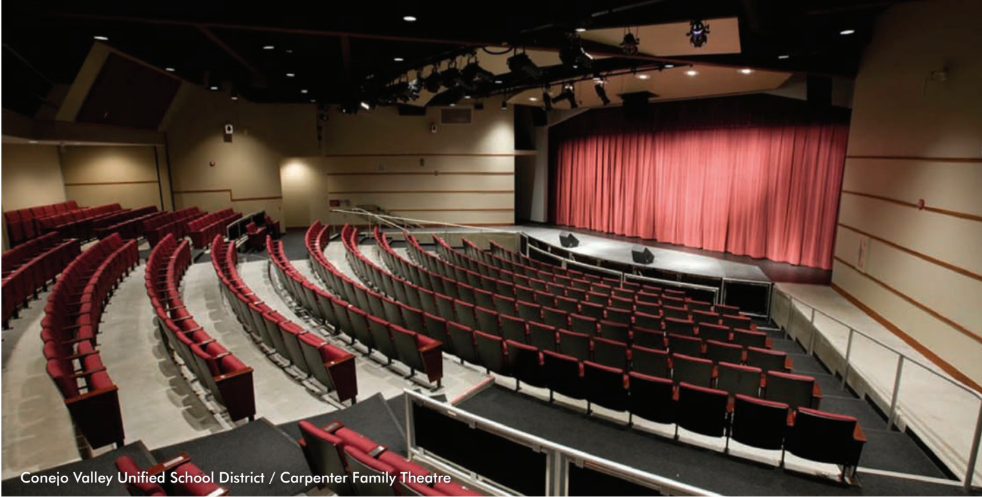
Conejo Valley Unified School District / Carpenter Family Theatre