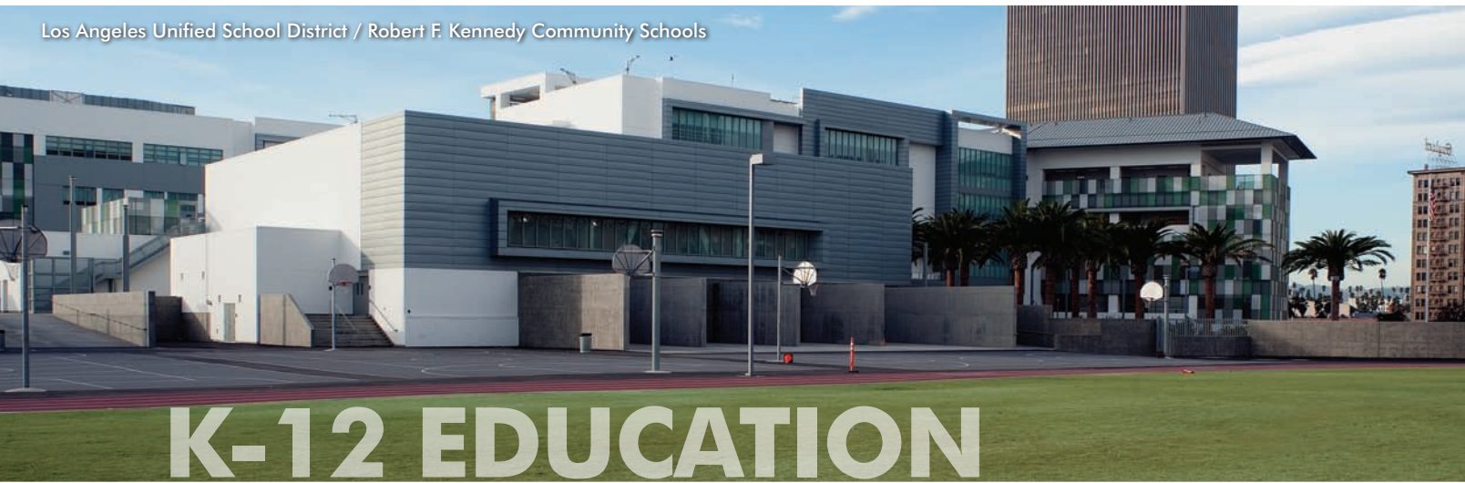
Los Angeles Unified School District / Robert F. Kennedy Community Schools